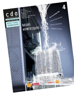
1. Packaging design for a range of mastic. - 2. Editorial page for Bradstone (magazine layout design). 3. Website design for FMB - 4. Poster design for Bains numériques event

Hobbies Collection of Apple devices from Jonathan Ive era (1998+) Rail transport modelling of Paris suburb. Landscape and still life photography.